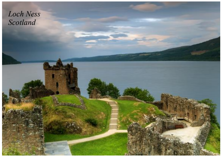
Loch Ness Scotland

Day 5: Saturday, May 18, 2024 • Dublin Our journey proceeds as we travel to Dublin. The first stop includes a visit to Blarney Castle. Of course, you may want to kiss the Blarney Stone and acquire the "gift of eloquence." Next, we see the Rock of Cashel, also known as St Patrick's Rock. Towering over the