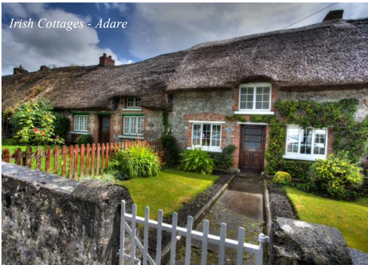
Irish Cottages - Adare

Day 1: Monday, May 13, 2024 • Depart USA Our British Isle adventure takes us on a trans-Atlantic flight to Shannon, Ireland.