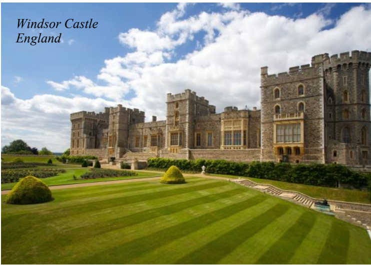
Windsor Castle England

include the Walter Scott Monument, the elegant Prince's Street, architectural wonders, plus much more! We have an inside tour of Edinburgh Castle, with its foreboding ramparts and walls, amazing city views, Crown jewels, and the siege gun, Mon's Meg. The afternoon is open for options, an opportunity to visit museums or Queen Elizabeth II's Yacht "Britannia", explore botanical gardens or the zoo, or perhaps shop for that special "Scottish Tweed." B